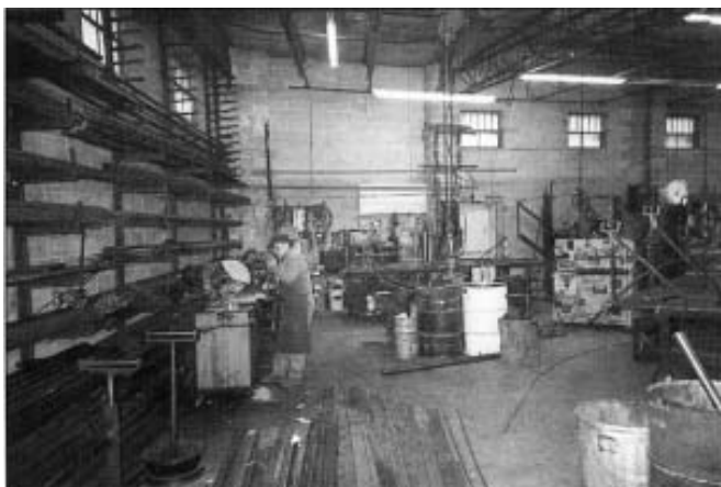
1) Once stock is put up, it can then be taken from the material rack to be cut and punched. Shown: Julius Molnar.