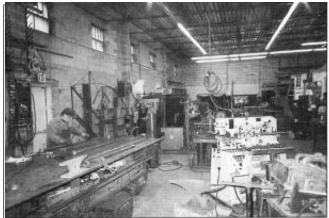
2) A layout area is at left, and the forging and punching stations are at right. Shown: Julius Molnar.