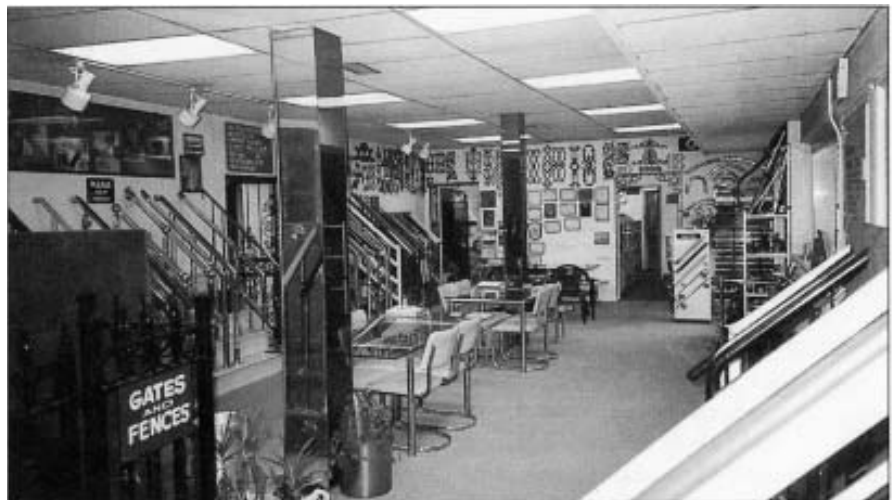
The showroom of Duke of Iron in Smithtown, N.Y., is both attractive and well organized. In the room are samples of fencing, handrails, railings, and castings.

Those fabricators who regularly tour shops during the METALfab conventions have the advantage when it comes to shop design. That's because they get to see what works and what doesn't work at fellow member shops. Chances are, if the same idea is used in many member shops it probably works very well. Some of the innovations regularly seen at NOMMA shops include mounting welders above layout tables on a swing rack, placing wheels on all equipment for flexibility, and using a "flow" system for handling jobs. Other things you'll frequently see at a NOMMA firm are carts for moving all materials (reduces back injuries) and high-ceiling areas for as-