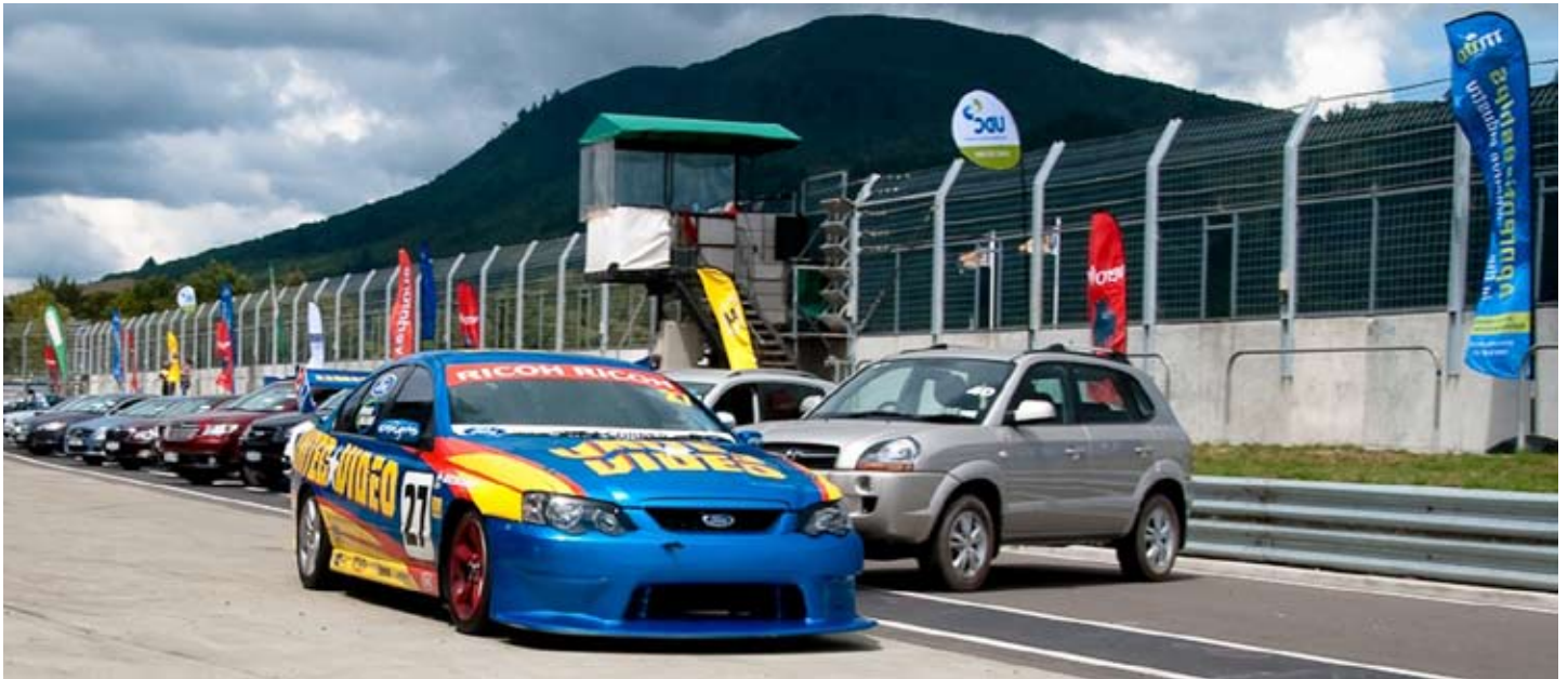
Vehicles waiting to be tested at the Taupo Motorsport Park.

“It rates as one of the best days ever!”