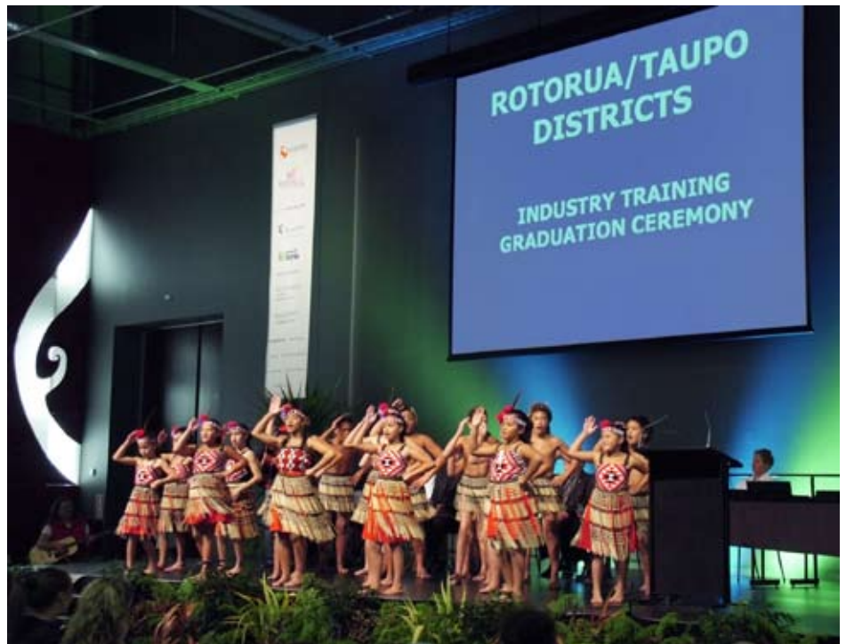
The Rotorua and Taupo 2008 graduation ceremony.

"There's always a big turnout, with lots of other people graduating and everyone supporting and applauding each other, including representatives