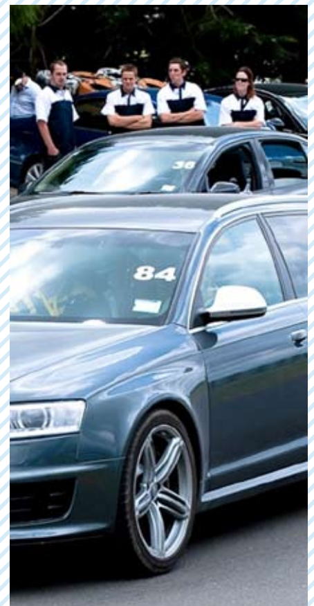
MITO high achievers watch vehicle testing during the AA Partners Day for the 2009 AA Motoring Excellence Awards.